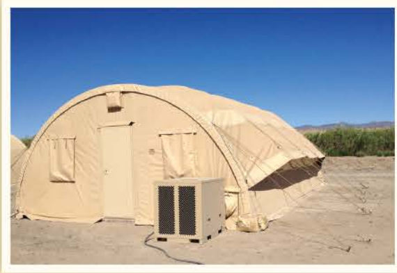
(P/N CAMSS-20Q-SF01-T) Tan (P/N CAMSS-20Q-SF01-G) Green